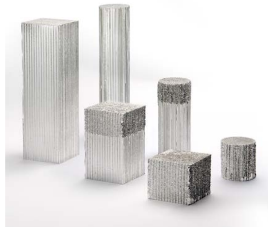
CrushLite™ absorbs energy by crushing under load

Transportation – Attenuates impact in Automotive and Rail applications where lightweight, high-performance energy absorption is critical for safety.